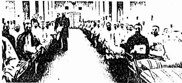
Interior of the Second Hospital of the St George Red Cross Society in 1904.

in scenting an aroma of kindly altruism in the Korotkoff household. This might account for Nicolai Korotkoff's apparent lack of interest in furthering his unique discovery. Indeed, it has been emphasised that one of the outstanding features of his personality was an intense "modesty." Perhaps this is not quite the right word, but to this characteristic has been attributed his rejection of an academic career and his refusal to develop, not