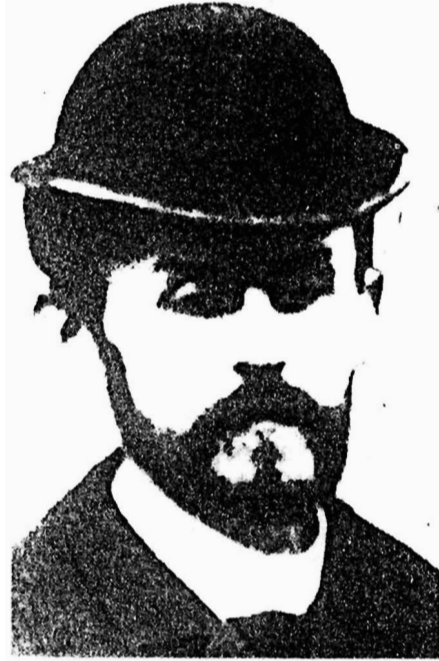
Dr N S Korotkoff.